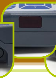
External Power Input