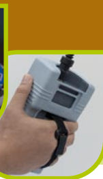
Velcro Strap for Firmer Grip